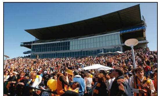
Final training day at Waverley before the Grand Final, 2008

The Hawks moved to their state of the art training and administrative headquarters in early 2006, paving the way for a new era of professionalism for the Hawks